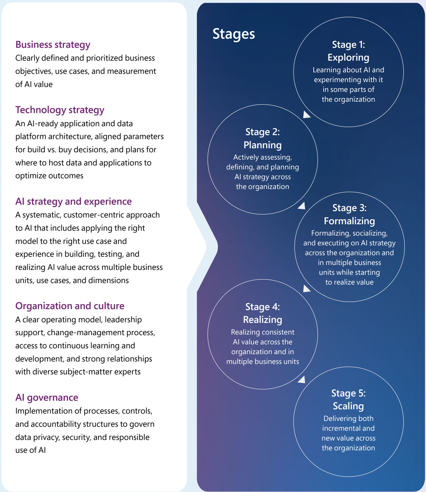
Figure 1: Five Pillars of AI Success